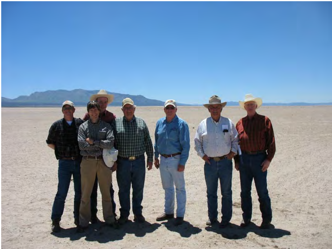
Past and Current Utah SRM Section Presidents at Milford Flats during Summer tour