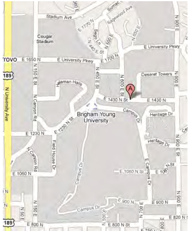
Bean Museum at BYU (marked as "A")